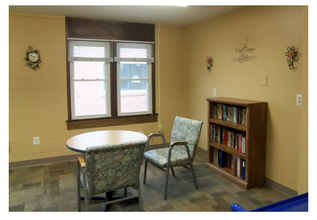
Pictured above and below is the new Activity Room.